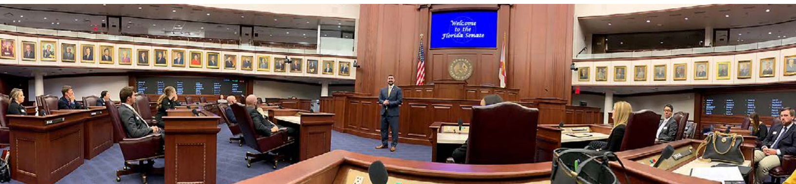
A Senate employee gives the class an overview of Senate operations.