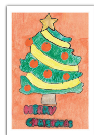
E29 Aiden, Wimauma