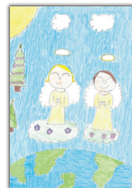
E15 Meilin, Wimauma