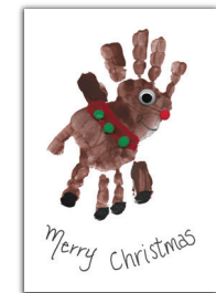
E27 Emery, Fellsmere