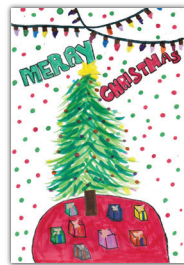
E23 Briseida, Wimauma