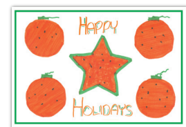
E8 Lymari, Immokalee