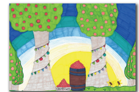
E6 Rosario, Wimauma