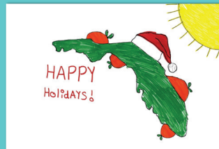
G2 Diego, Immokalee

May peace, joy and happiness bless your holiday season