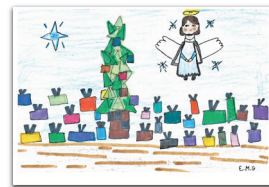
E1 Emily, Wimauma

Proceeds from this year's sales will be included in the Ring the Bell: be the difference capital campaign to build a state-of-the-art Dual Language K-8 charter school in Mulberry, FL. Your support will elevate resources and holistic development for hundreds of children and families.