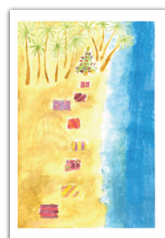
E30 Itzel, Wimauma