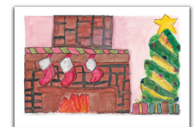
E13 Tanya, Wimauma