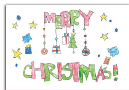
E9 Santiago, Wimauma