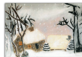
E12 Angelica, Wimauma