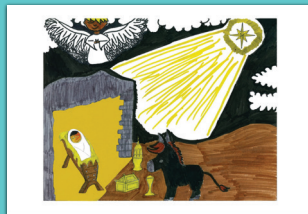
G1 Luis, Wimauma

Enjoy these 3 designs from our general selection of non-exclusive Holiday cards. Each $15 package contains 10 cards with envelopes. See order form for details.