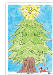
E33 Esteban, Wimauma