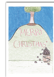
E19 Zulma, Wimauma